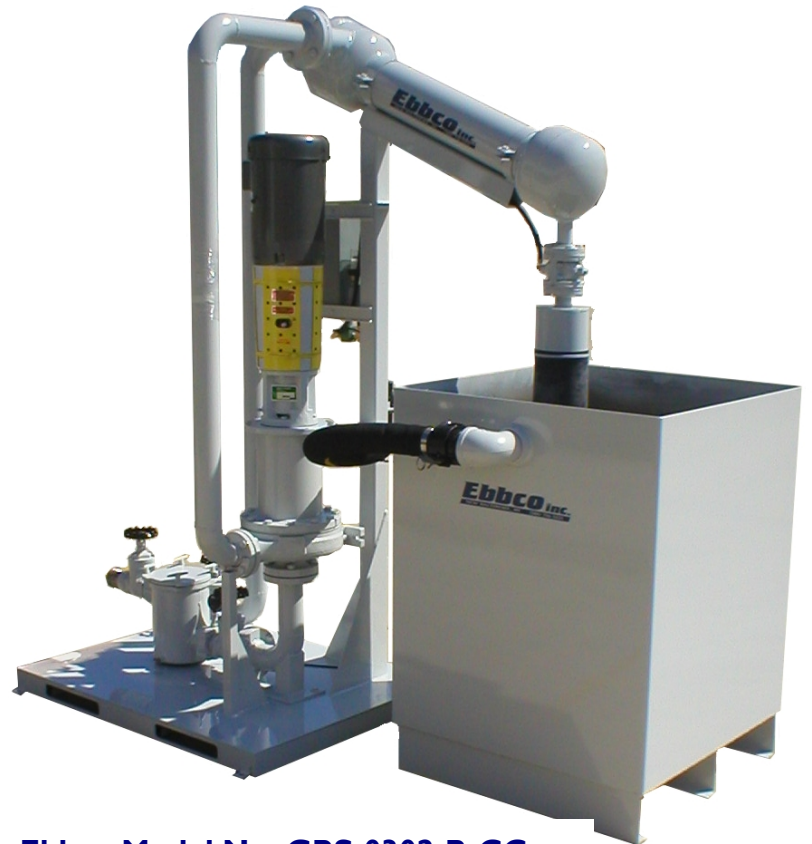
Ebbco Model No: GRS-0302-B-CC